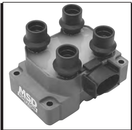
Figure 1 The MSD Ford 4- Tower Coil Pack.

WARNING: High Voltage is present on the coil terminals. DO NOT touch the coil terminals or tower when the engine is cranking or running.