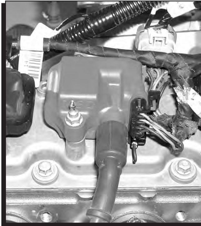
Figure 2 Installing the MSC Coil.